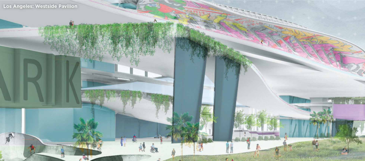
Los Angeles: Westside Pavilion