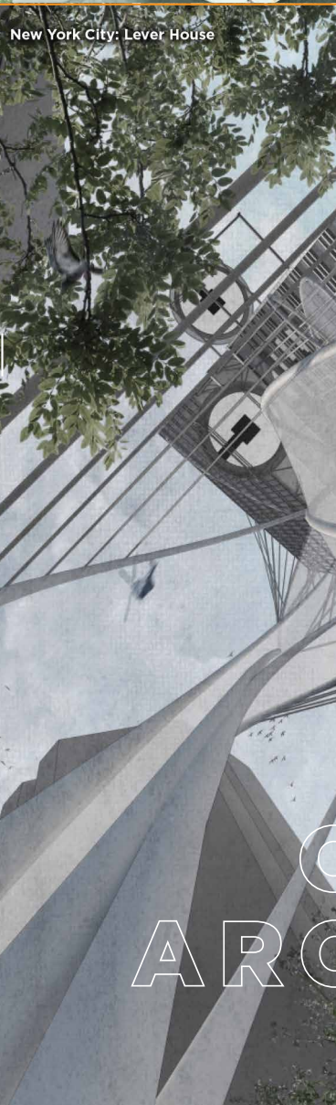
New York City: Lever House