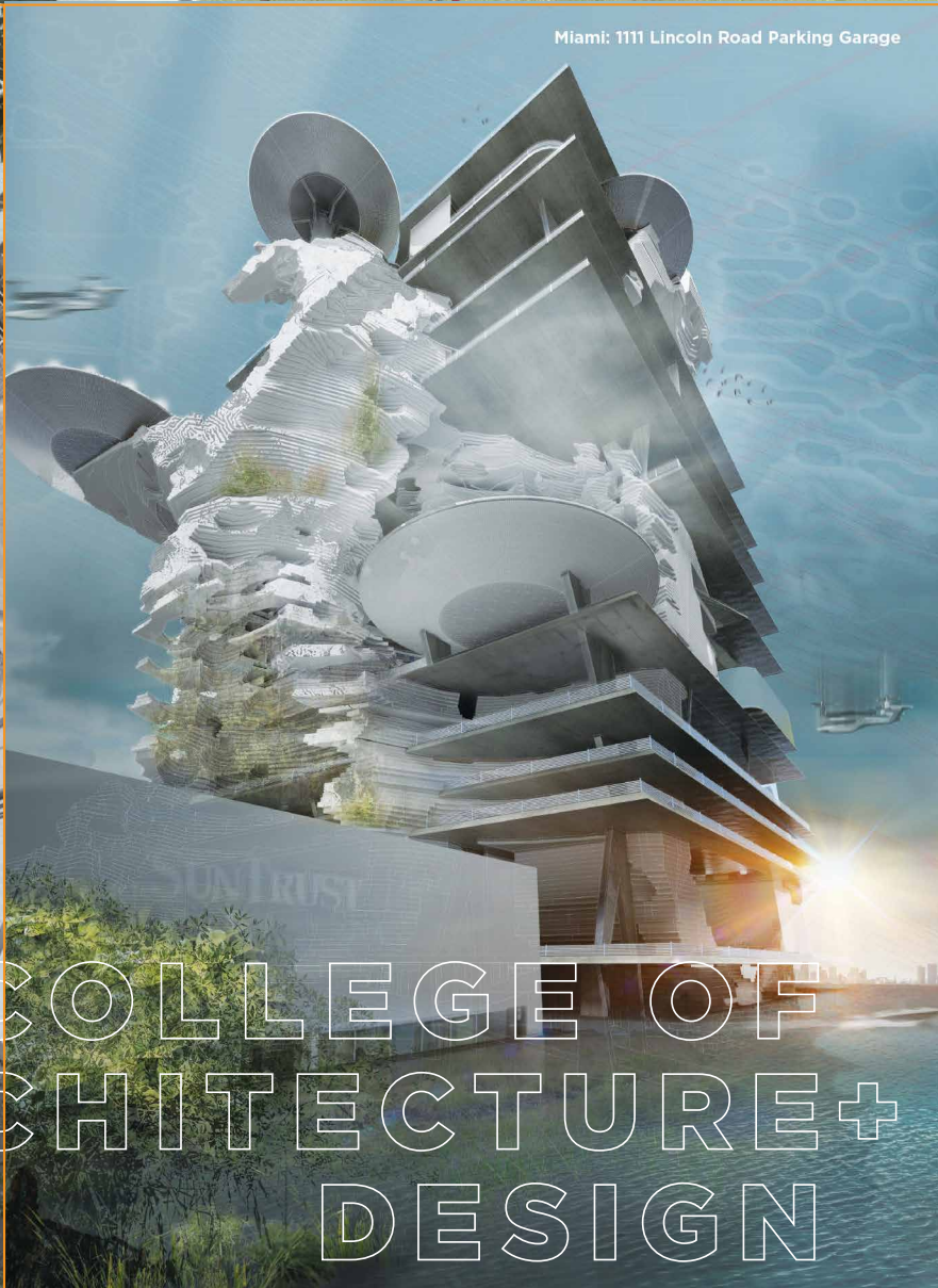
Miami: 1111 Lincoln Road Parking Garage