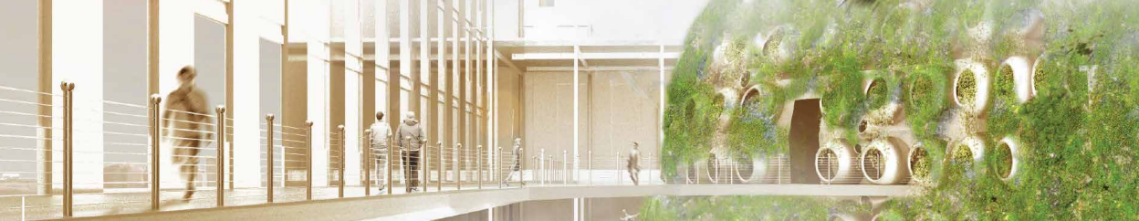
Detroit: Michigan Central Station

A CULTURE OF CREATIVITY, COLLABORATION, SCHOLARSHIP, AND DISCOVERY